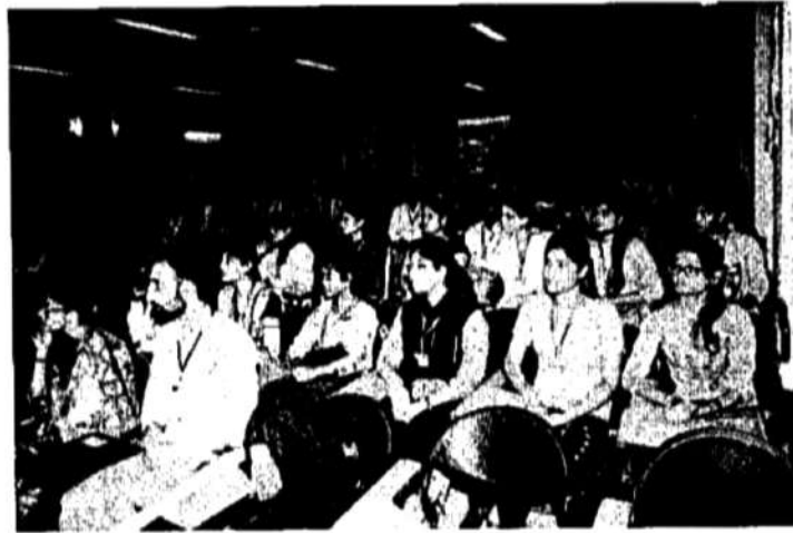
Registrar Rani Durgavati Vishwavidyalaya Jabalpur