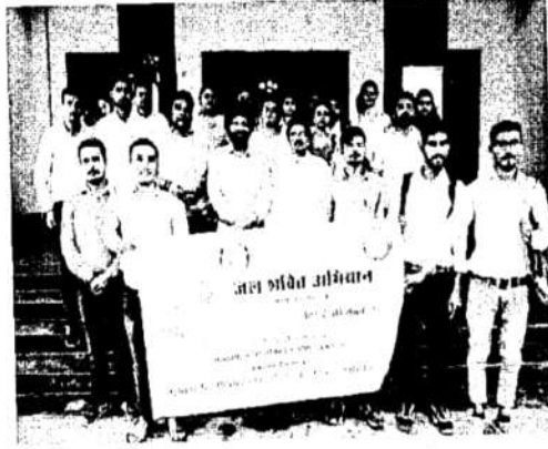
• DIC PROTOTYPE EXHIBITION